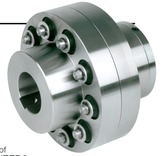
Back of AL..KEED2