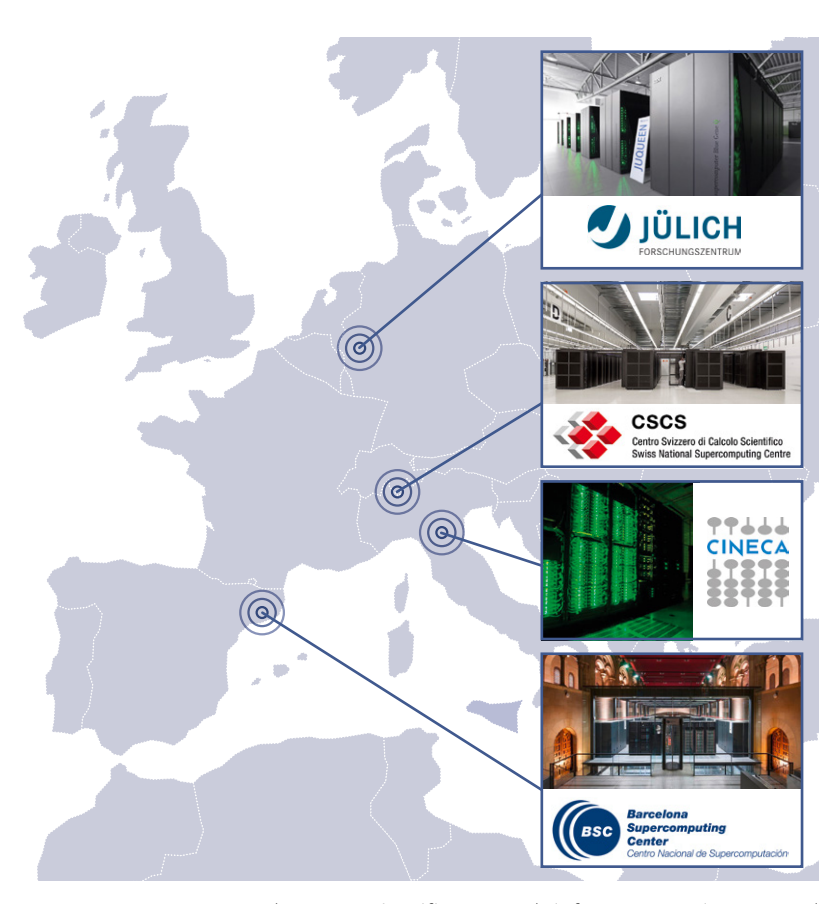
The HBP scientific research infrastructure is powered by the most powerful supercomputers in Europe

The HBP is creating an advanced ICT platform to support researchers studying the brain and its diseases, empower brain-inspired computing and drive technological development. It includes cloud-based collaborative virtual experiments, data analytics, and compute services and databases that enable meta-data handling and provenance tracking. Leading-edge supercomputers, brain-inspired neuromorphic computers, and neurorobotic systems combining simulated brains with robotic bodies, are being provided to scientists. The HBP is developing advanced software for big data analytics, modelling and simulation at all levels of brain organisation - from the level of single molecules to the whole brain - to understand how the different levels of brain organization interact and generate complex behaviour. Researchers can access all these from their own laboratories and collaborate with other labs.